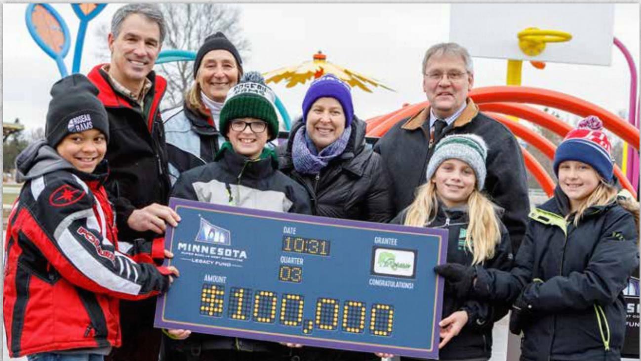
Roseau's South Riverview Park Project Grant Award Ceremony