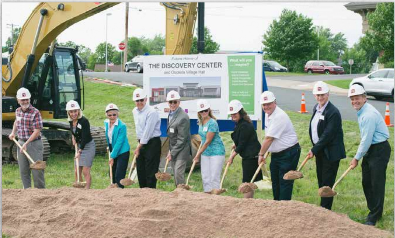
Osceola Discovery Center Groundbreaking Ceremony

Launched as the Osceola Discovery Center it was designed to be a place where people have access to information, technology, shared common spaces, and tools and equipment for 21st century needs. It will also include the village hall, complete with its police department and municipal court, a new and larger public library, and a business hub and videoconference center. In addition, an innovative Fab Lab will be included to function as a hands-on training facility for the technical skills needed to work in Polaris' local manufacturing center.