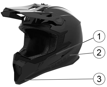
Black 2865408 / 2865418 (Youth)