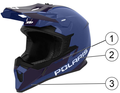
Blue 2865412 / 2865420 (Youth)