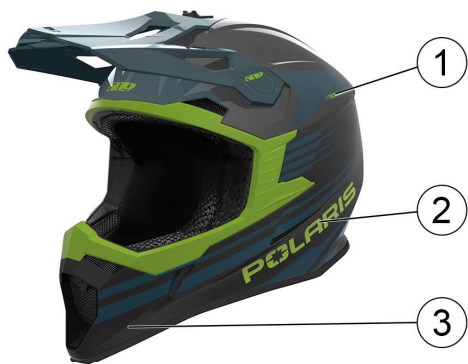
Teal/Lime 2865411 / 2865419 (Youth)