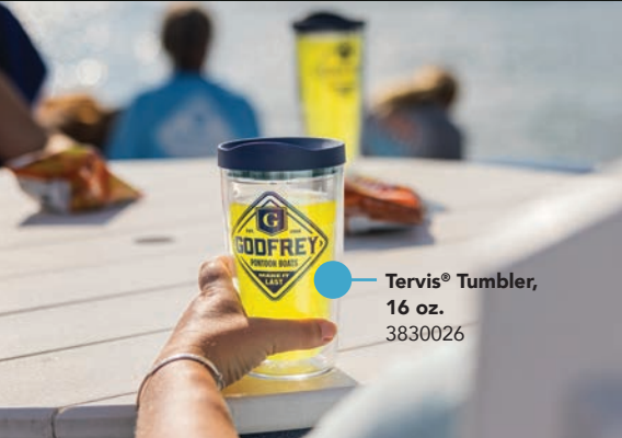
Tervis® Tumbler, 16 oz. 3830026

godfreypontoonboats.com/en-us/shop/accessories