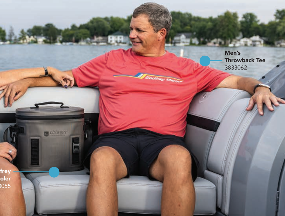
Godfrey Soft-Sided Cooler 3830055