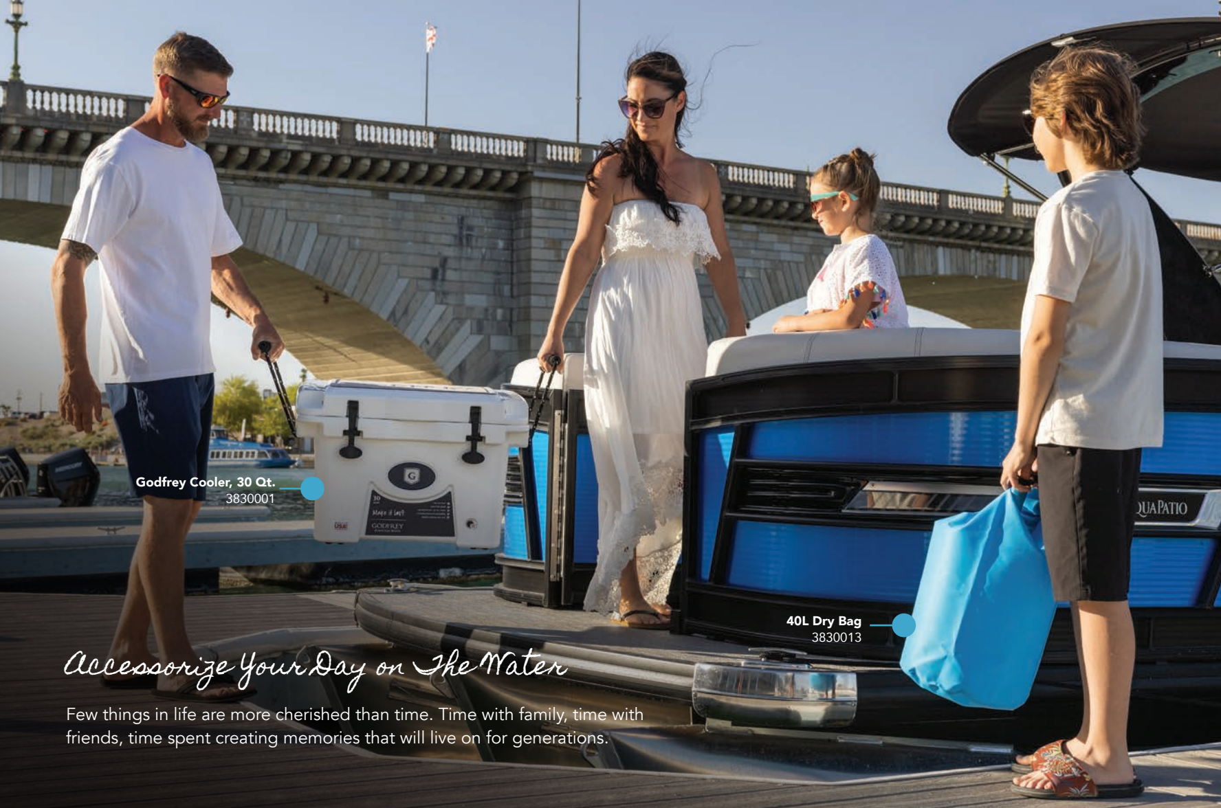
Godfrey Cooler, 30 Qt. 3830001