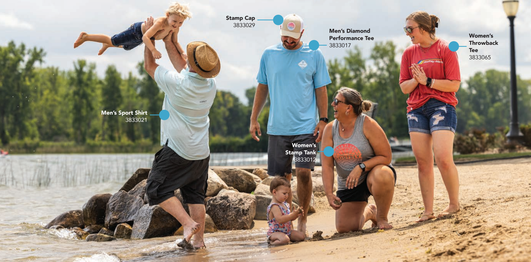
Men's Sport Shirt 3833021

Make a splash in fashion that transcends the water. Show your pontoon pride and create enduring memories in every piece, echoing the legacy of your unforgettable adventures.