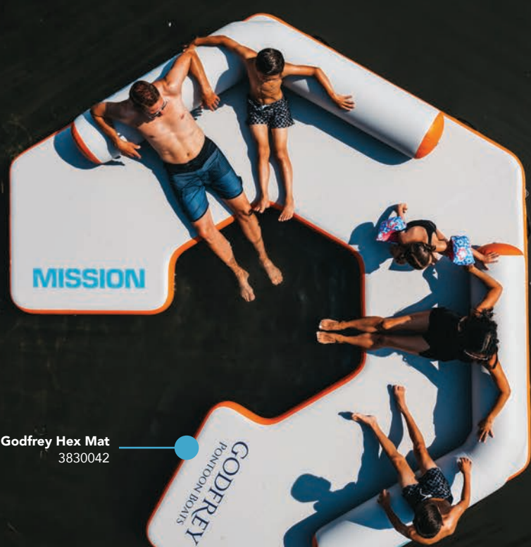
Godfrey Hex Mat 3830042

Seamlessly accompanying you from pontoon to shore, making every step of your journey as thrilling as the first ignition.