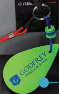
Floatable Key Chain 3830061

Companion to keep your boat adventures hassle-free.