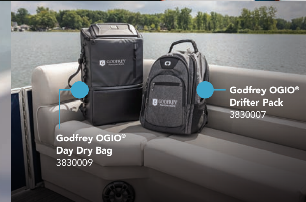
Godfrey OGIO® Day Dry Bag 3830009