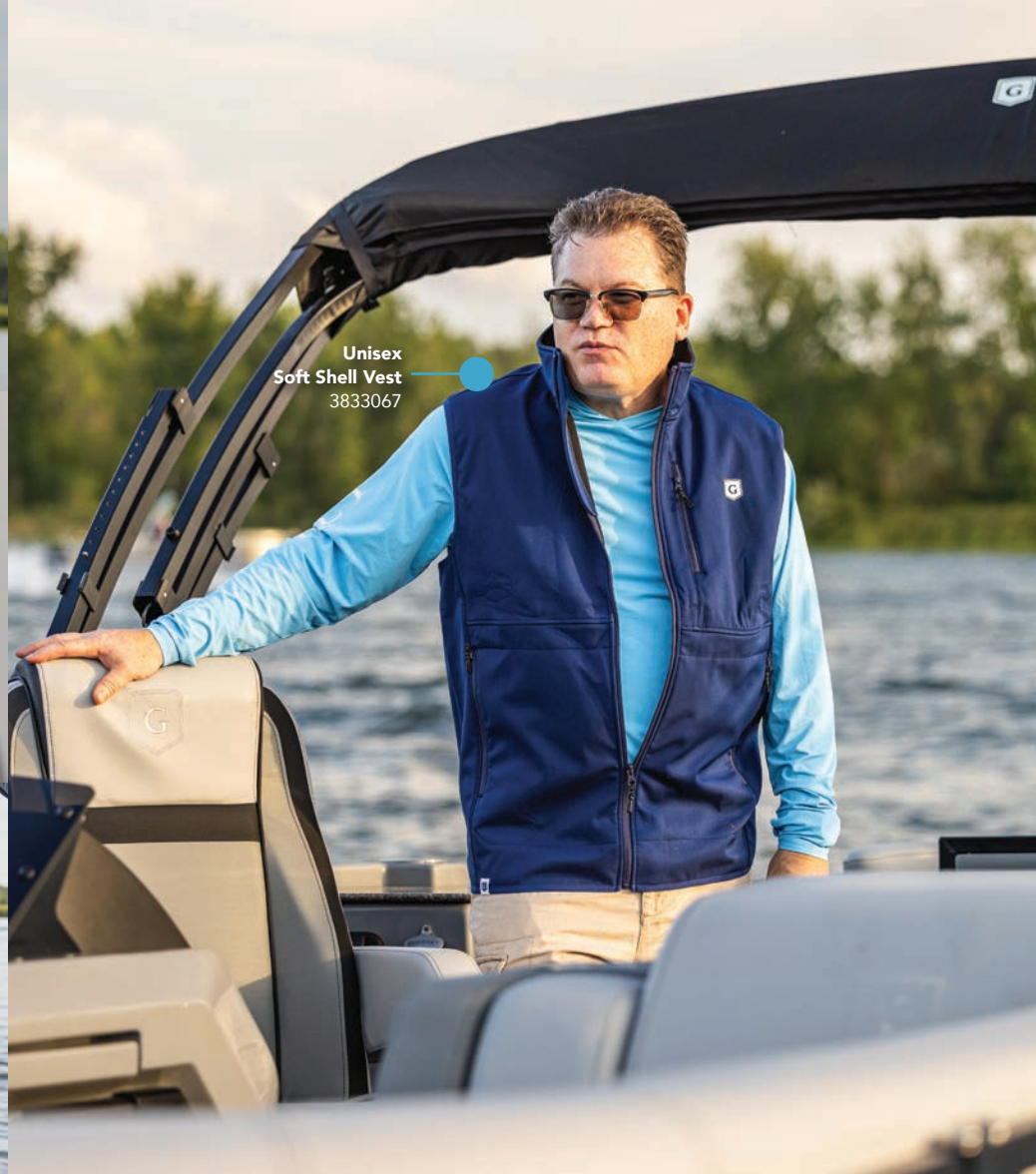
Unisex Soft Shell Vest 3833067