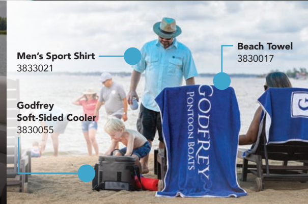
Men's Sport Shirt 3833021