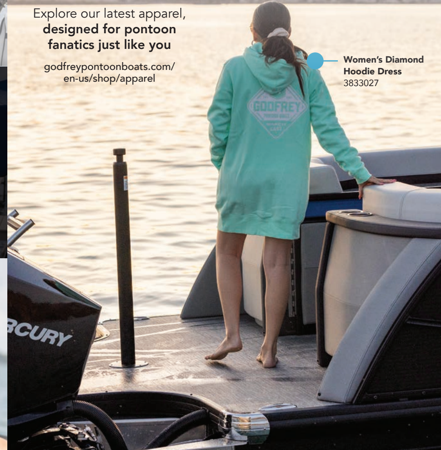
Women's Hoodie Dress 3833027

godfreypontoonboats.com/ en-us/shop/apparel