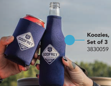
Koozies, Set of 3 3830059

Your onboard gatherings, keeping your drinks frosty and the good times flowing.