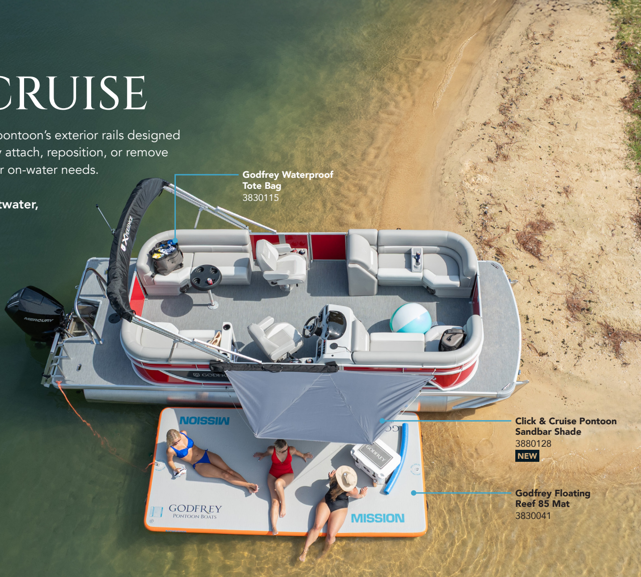
Godfrey Waterproof Tote Bag 3830115

godfreypontoonboats.com/en-us/boat-accessory-attachment-system/