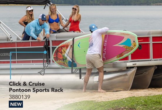
Click & Cruise Pontoon Sports Rack 3880139 NEW

Spend less time adjusting and more time enjoying the water.