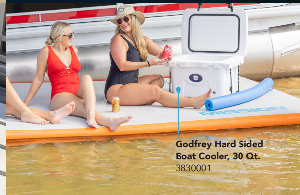
Godfrey Hard Sided Boat Cooler, 30 Qt. 3830001