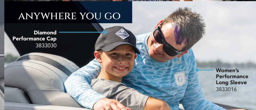
Diamond Performance Cap 3833030