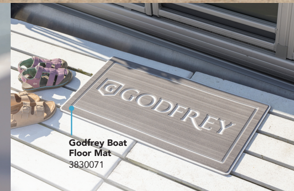
Godfrey Boat Floor Mat 3830071