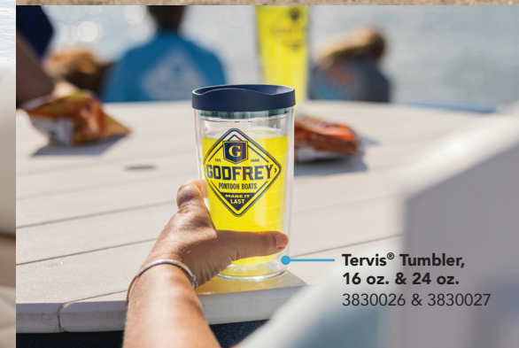
Tervis® Tumbler, 16 oz. & 24 oz. 3830026 & 3830027

godfreypontoonboats.com/en-us/shop/accessories