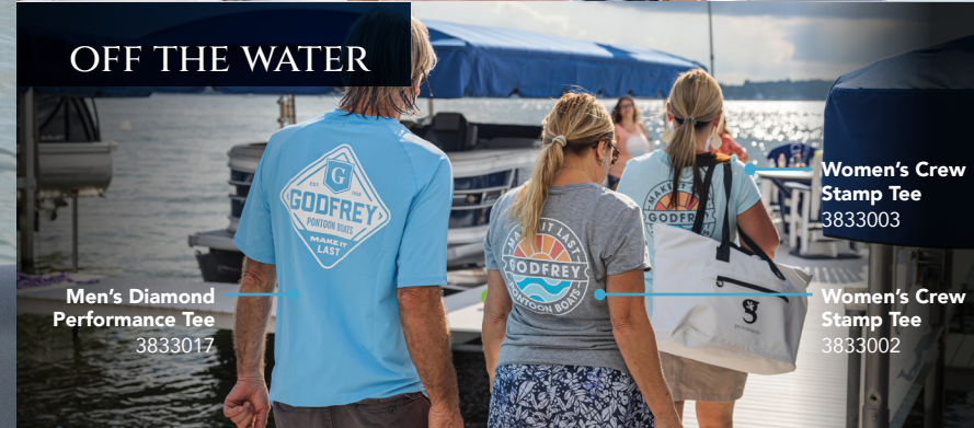
Men's Diamond Performance Tee 3833017