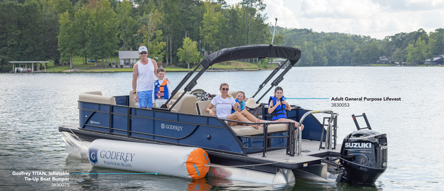
Godfrey TITAN, Inflatable Tie-Up Boat Bumper 3830075