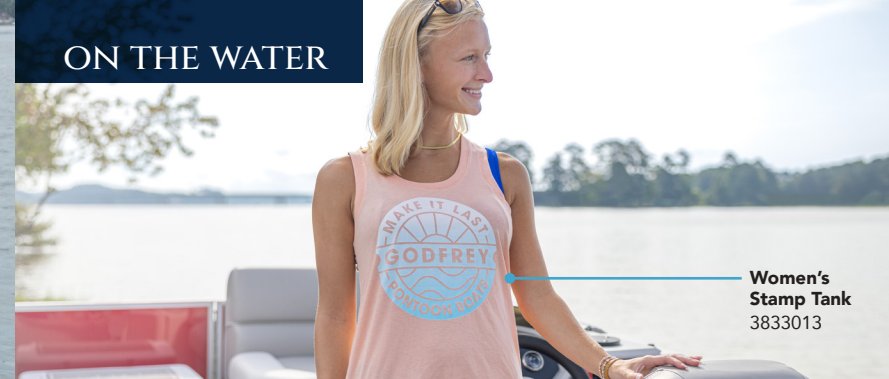
Women's Stamp Tank 3833013