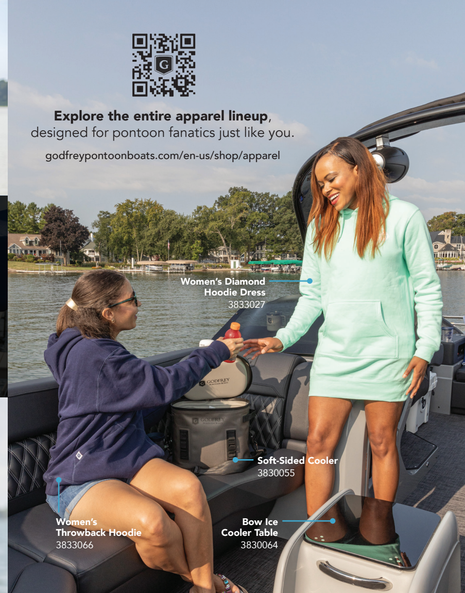
Women's Diamond Hoodie Dress 3833027

godfreypontoonboats.com/en-us/shop/apparel