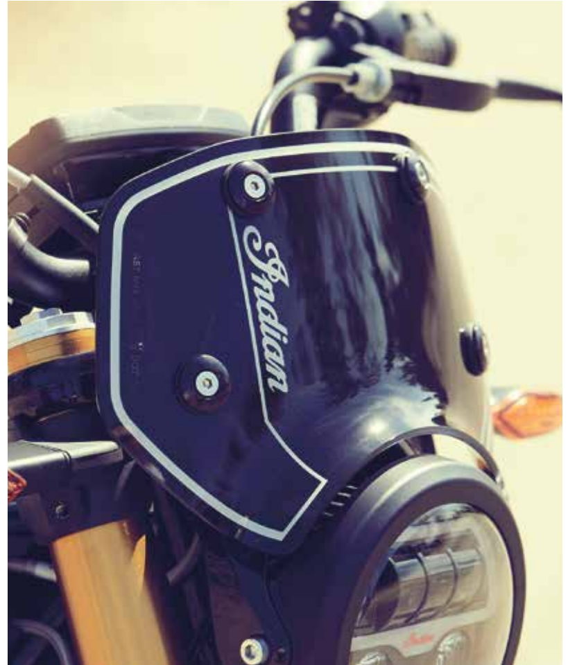
Professional rider. Closed course. Do not attempt.