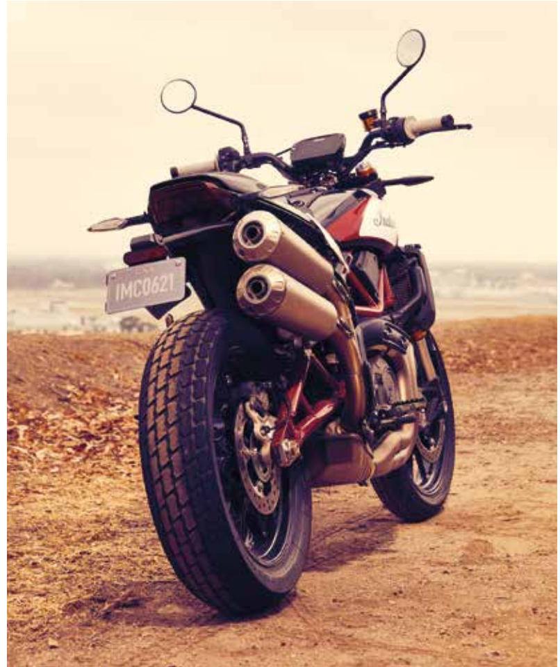
International version of Clear Turn Signals Shown