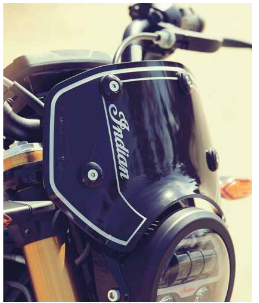
Professional rider. Closed course. Do not attempt.