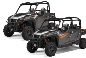
GENERAL 1000 PREMIUM GENERAL 41000 PREMIUM