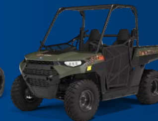
RANGER 150 EFI AGES 10+