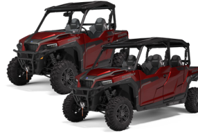
GENERAL 1000 DELUXE GENERAL 41000 DELUXE