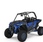
RZR XP 1000 TRAILS & ROCKS