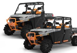
RANGER XP 1000 HIGH LIFTER EDITION RANGER CREW XP 1000 HIGH LIFTER EDITION