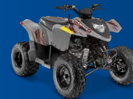
PHOENIX 200 AGES 14+