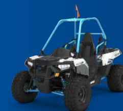
ACE 150 EFI AGES 10+