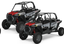
RZR XP TURBO RZR XP 4 TURBO

4-Stroke DOHC Twin-Cylinder Turbocharged