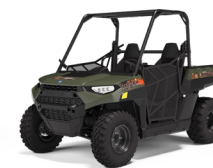
RANGER 150 EFI