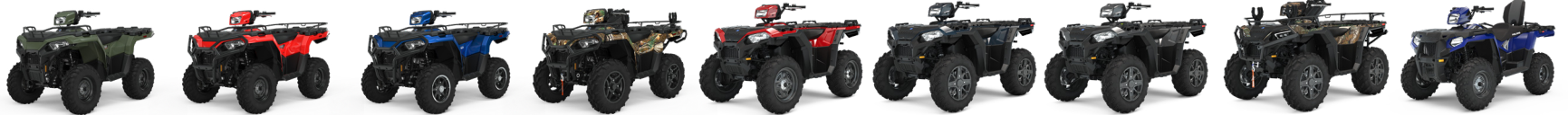
SPORTSMAN 450 H.O. SPORTSMAN 450 H.O. EPS