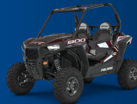
MODEL SHOWN: RZR S 900 PREMIUM