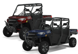
RANGER XP 1000 PREMIUM RANGER CREW XP 1000 PREMIUM