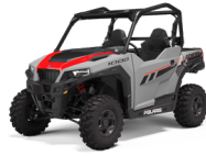
GENERAL 1000 SPORT