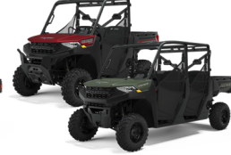
RANGER 1000 RANGER CREW 1000 RANGER CREW 1000