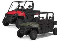
RANGER 570 FULL-SIZE RANGER CREW 570 FULL-SIZE