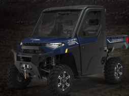
CREW MODEL AVAILABLE

No matter the weather, NORTHSTAR's sealed cab and factory-installed HVAC system will give you the confidence to go forward. And with 82HP and an industry-leading 2,500lbs of towing capacity, you'll enjoy unrivaled productivity with unmatched comfort.