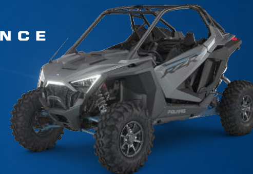
MODEL SHOWN: RZR PRO XP ULTIMATE