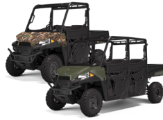
RANGER 570 RANGER CREW 570