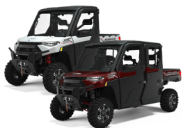
RANGER XP 1000 NORTHSTAR PREMIUM RANGER CREW XP 1000 NORTHSTAR PREMIUM