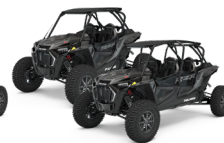
RZR TURBO S RZR TURBO S 4

4-Stroke DOHC Twin-Cylinder Turbocharged