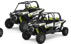
RZR XP 1000 SPORT RZR XP 4 1000 SPORT