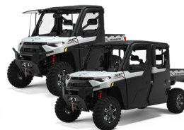
RANGER XP 1000 NORTHSTAR TRAIL BOSS RANGER CREW XP 1000 NORTHSTAR TRAIL BOSS