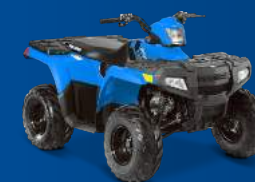
SPORTSMAN 110 EFI AGES 10+