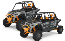
RZR XP 1000 HIGH LIFTER RZR XP 4 1000 HIGH LIFTER