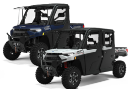
RANGER XP 1000 NORTHSTAR ULTIMATE RANGER CREW XP 1000 NORTHSTAR ULTIMATE