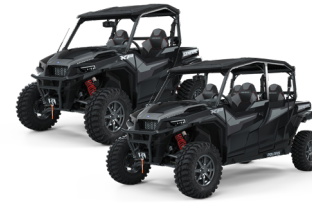
GENERAL XP 1000 DELUXE GENERAL XP 41000 DELUXE