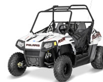
RZR 170 EFI