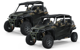
GENERAL XP 1000 PURSUIT EDITION GENERAL XP 41000 PURSUIT EDITION