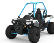
ACE 170 EFI