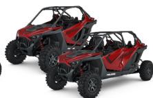
RZR PRO XP SPORT RZR PRO XP 4 SPORT

4-Stroke DOHC Twin-Cylinder Turbocharged