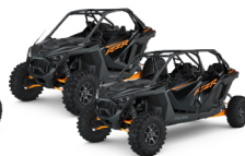
RZR PRO XP PREMIUM RZR PRO XP 4 PREMIUM

4-Stroke DOHC Twin-Cylinder Turbocharged