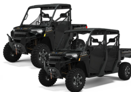
RANGER XP 1000 TEXAS EDITION RANGER CREW XP 1000 TEXAS EDITION