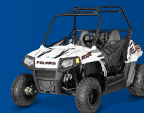
RZR 170 AGES 10+