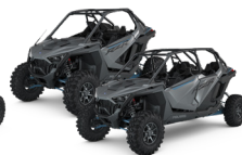
RZR PRO XP ULTIMATE RZR PRO XP 4 ULTIMATE

4-Stroke DOHC Twin-Cylinder Turbocharged