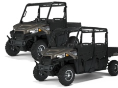
RANGER 570 PREMIUM RANGER CREW 570 PREMIUM