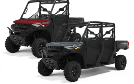
RANGER 1000 PREMIUM RANGER CREW 1000 PREMIUM