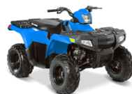
SPORTSMAN 110 EFI