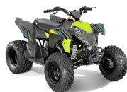
OUTLAW 110 EFI