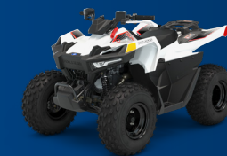
OUTLAW 70 EFI AGES 6+