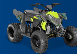
OUTLAW 110 EFI AGES 10+