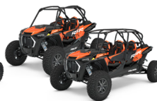
RZR TURBO S VELOCITY RZR TURBO S 4 VELOCITY

4-Stroke DOHC Twin-Cylinder Turbocharged