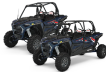
RZR XP 1000 PREMIUM RZR XP 4 1000 PREMIUM