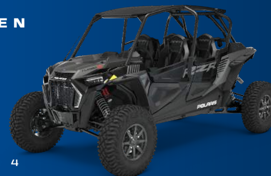
MODEL SHOWN: RZR TURBO S 4