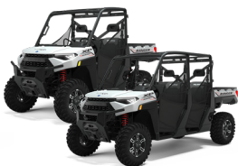
RANGER XP 1000 TRAIL BOSS RANGER CREW XP 1000 TRAIL BOSS