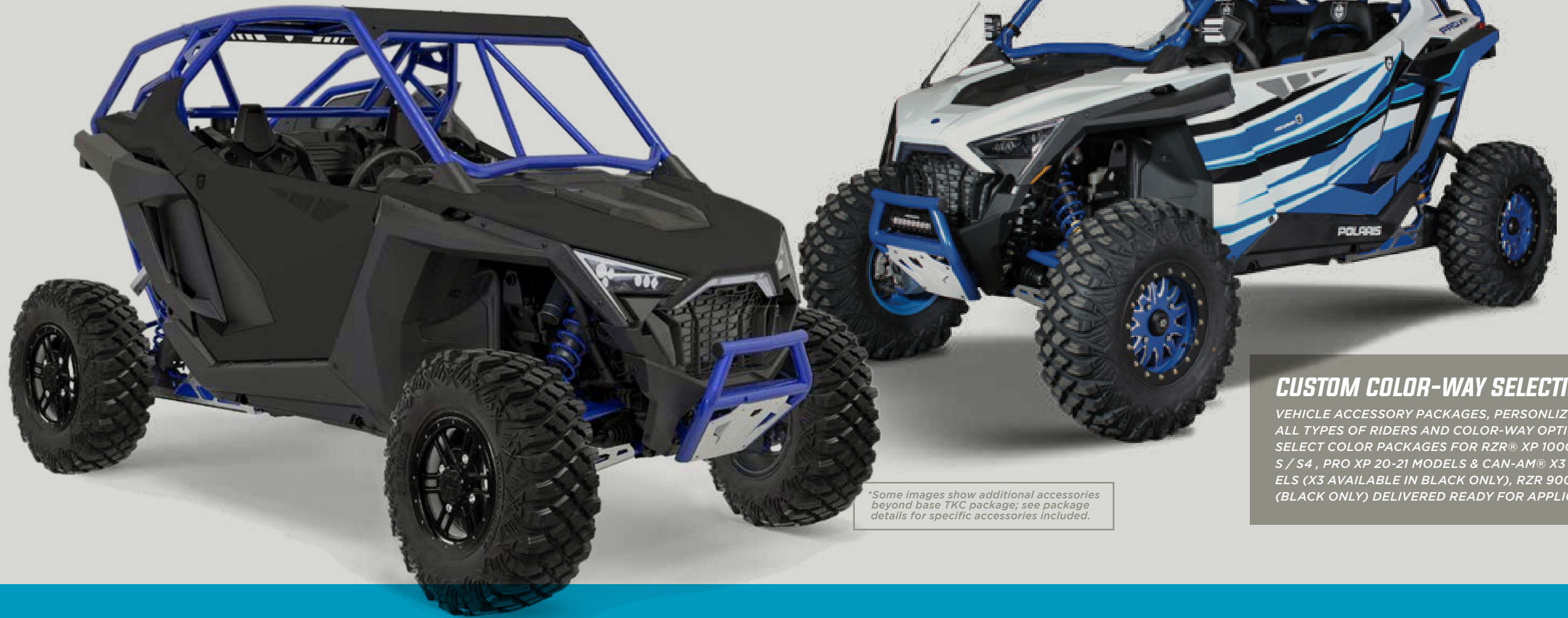
*Some images show additional accessories beyond base TKC package; see package details for specific accessories included.

EACH KIT INCLUDES: CAGE / ROOF / DOORS / SEATS / HARNESES