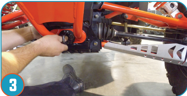
3 Install M10 bolts (2) and factory chasis loop through frame and factory mounting plate then hand tighten.