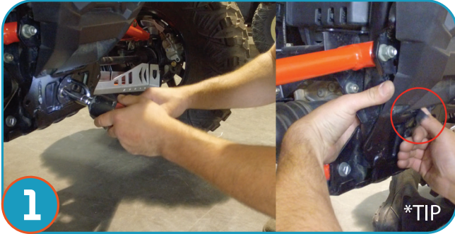
1 Remove stock chasis loop from front of vehicle. *TIP: Place tape to assist in holding chasis loop mounting plate from falling behind differential.

***NOTE: Prior to installation, please verify if a revised version of this instruction sheet is available on proarmor.com.***