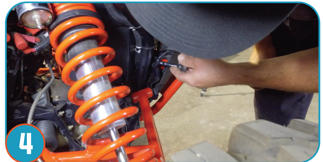
4 Check to make sure bumper is square on vehicle and properly lined up. Tighten ALL mounting points (upper and lower bolts) to secure bumper.