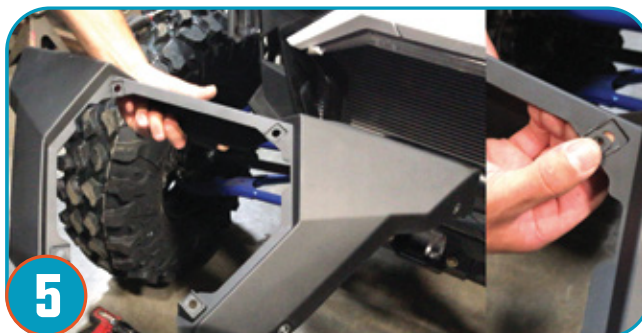
5 Remove plastics from vehicle, remove four (4) clips from the plastics and set plastics aside for later step.