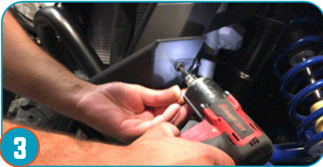
3 Remove four (4) bolts holding lower bumper plastics. Note*** Top bolt is longer and bottom is short.