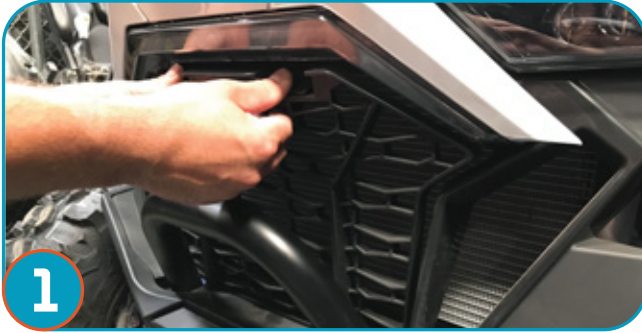
1 Remove the stock grille insert by depressing the release tabs.

***NOTE: Prior to installation, please verify if a revised version of this instruction sheet is available on proarmor.com .***