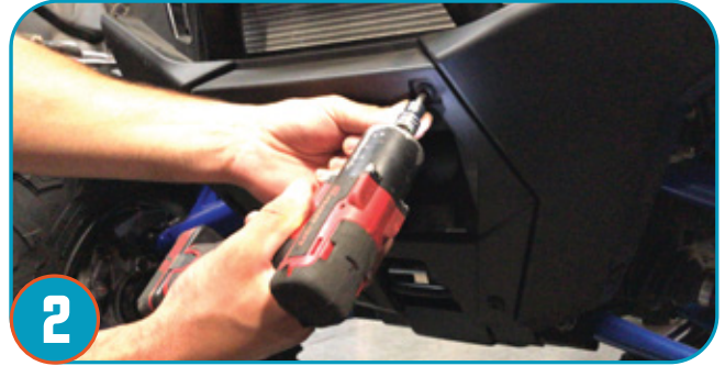
2 Remove four (4) bolts holding center bumper plastics.