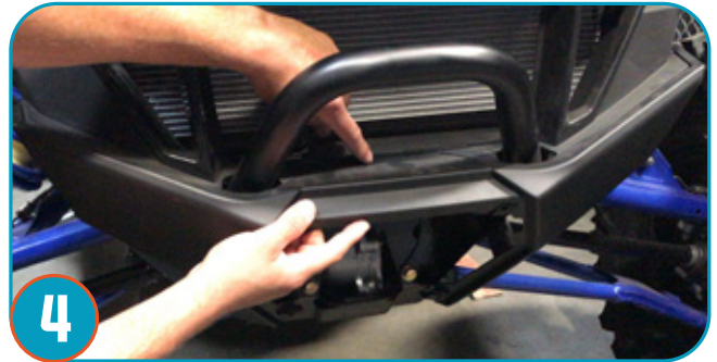
4 Depress center clip and remove lower bumper plastics and set aside to re-apply in later steps.