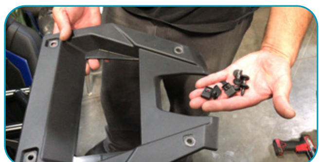
Note***Items displayed will not be re-used or re-applied to vehicle. (Center bumper plastics, 4 clips, 4 bolts).