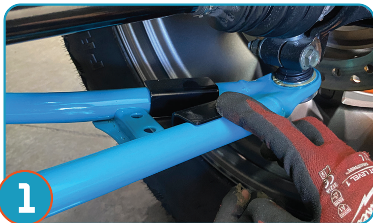
1 Place the provided mounting bracket as shown.