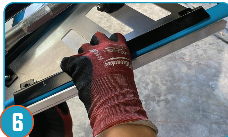
6 Position and tighten opposite long bracket to arm tube as shown.