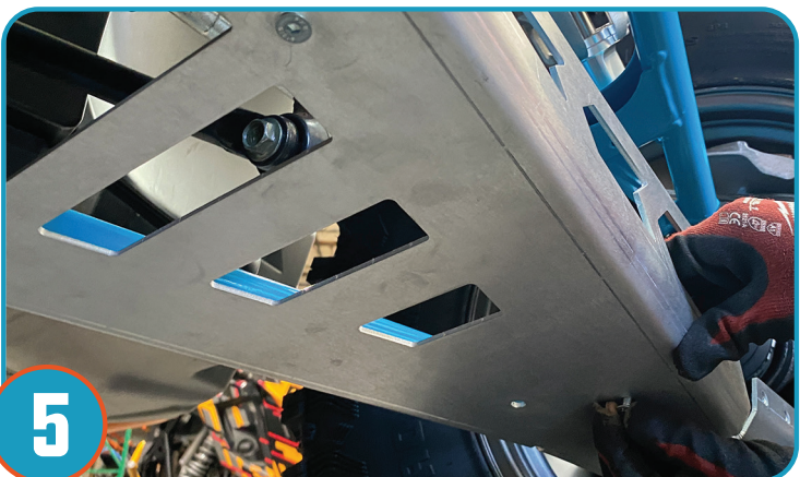
5 Using 2 of the provided 6mm screws, hand tighten to hold long bracket to A-arm guard.