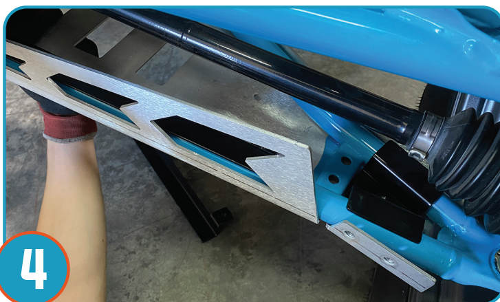
4 Position one side of the long mounting bracket as shown.