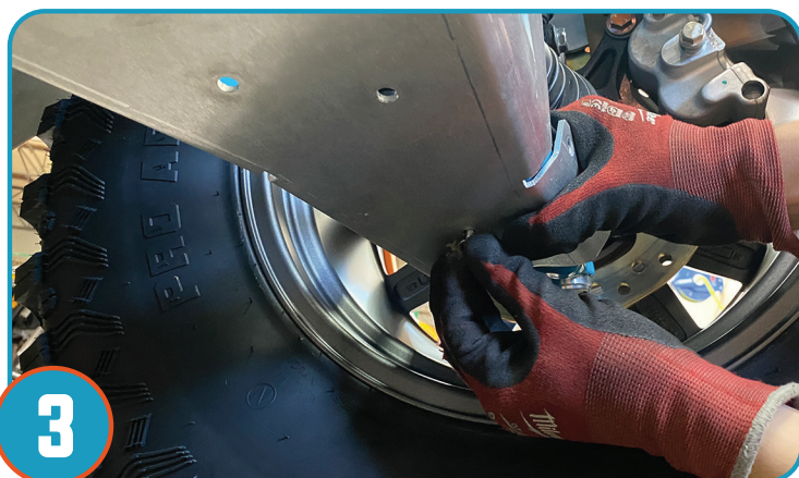
3 Using a provided 6mm screw, Hand tighten to hold guard in place.