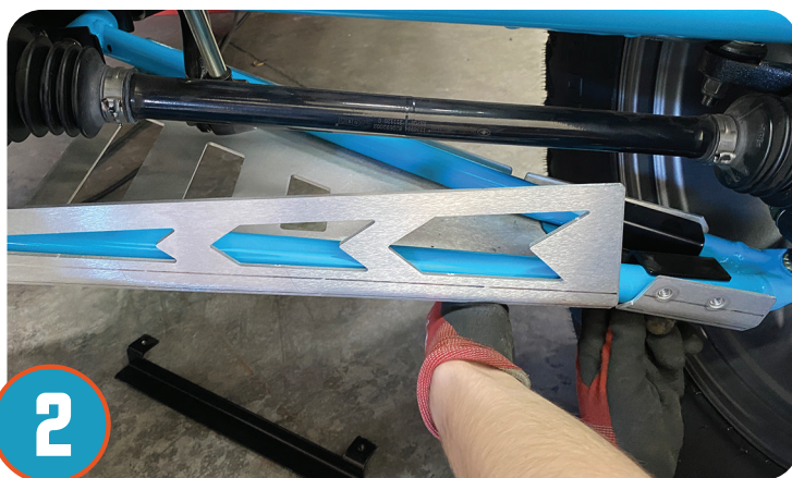
2 Position the Arm Guard, lining up hole on bottom of A-arm guard.