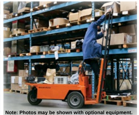
Note: Photos may be shown with optional equipment.