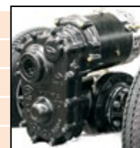
GT Automotive Drive (SC-100 only)