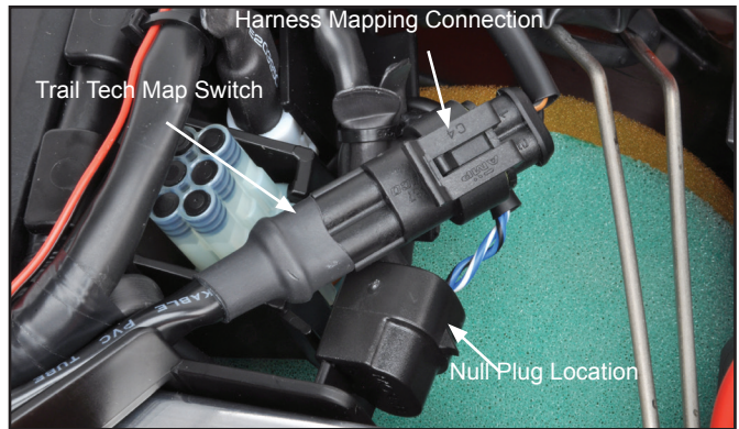
TRAIL TECH IGNITION MAP SWITCH CONNECTION