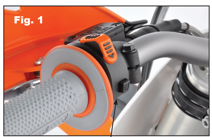
TRAIL TECH IGNITION MAP SWITCH INSTALLED

4. Route the kill leads following the stock routing path and install. (Fig. 2)