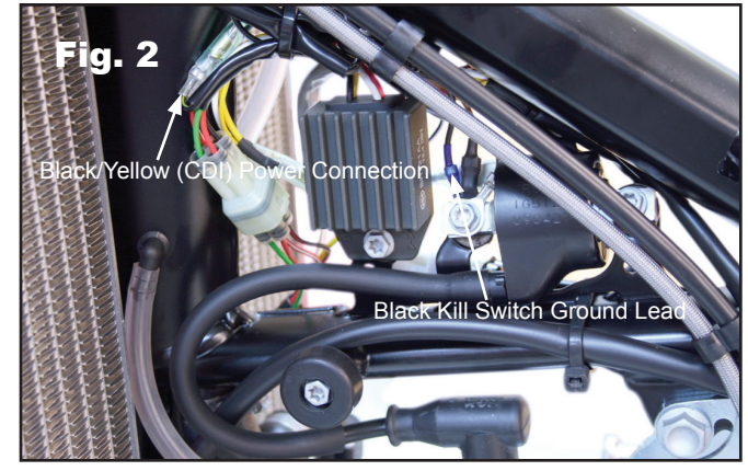
STOCK KILL SWITCH LEADS

KTM 2013-2014 450 SX-F/XC-F KTM 2008-2014 690 ENDURO KTM 2009-2014 690 DUKE KTM 2009 690 SMC