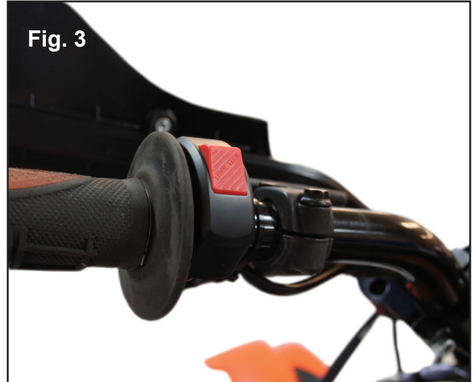
TRAIL TECH IGNITION MAP SWITCH INSTALLED