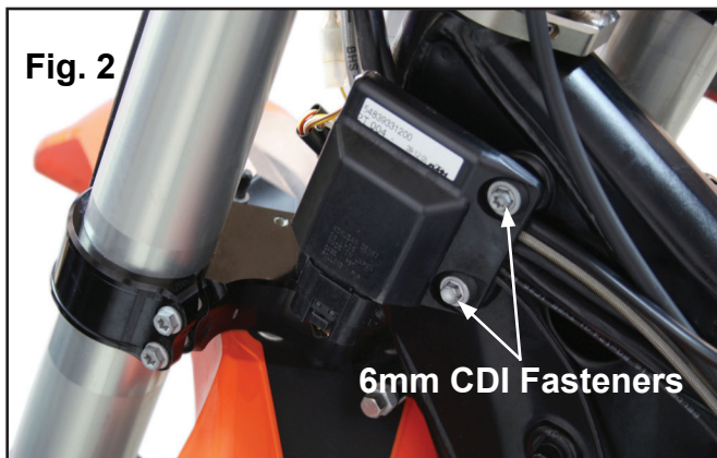
LOOSEN CDI FASTENERS