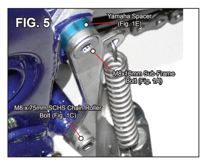
2005 YZ250F/YZ450F Kickstand Bracket Installed

Note: Use thread locking compound and manufacturers torque specification during installation.