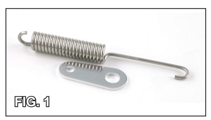
5203-PK Parts Kit