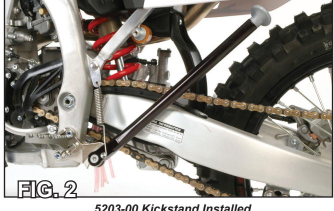
5203-00 Kickstand Installed

A. 5905-04 Kickstand Spring B. 5903-00 Hanger Tab