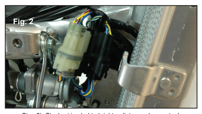
Step 2) Stock wiring behind right radiator, under gas tank.