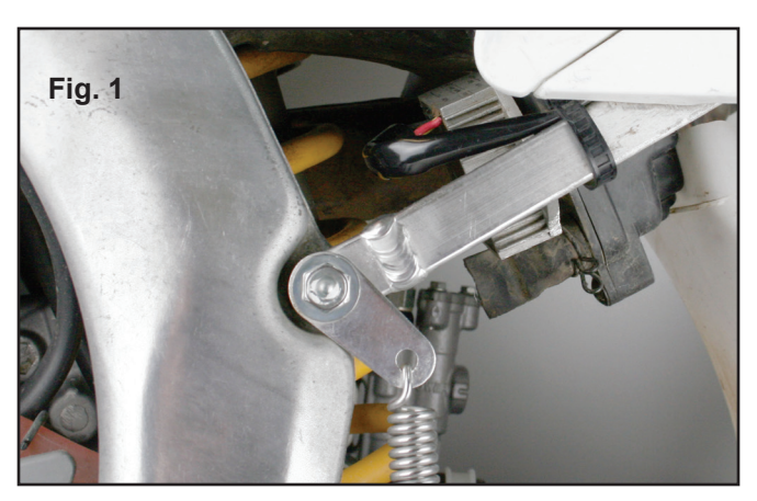
Honda 450X models reg/rec is located at the air-box