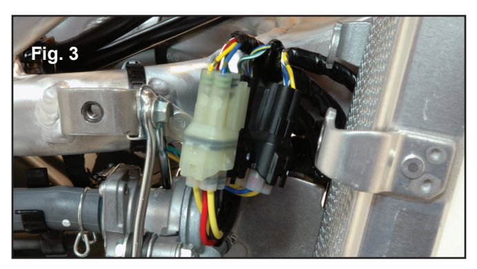
Steps 3) Trail Tech stator plugged in